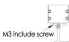
M3 include screw

1、 Drill two holes in the wall or floor according to the hole size of the support, and put glue plugs or wood blocks into the holes.